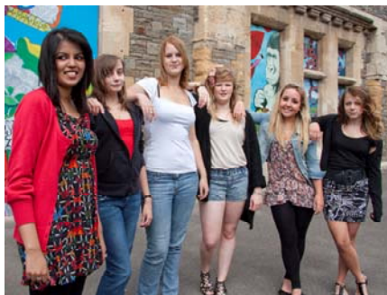
The students involved in the Clifton Down Railway project

Some of our Year 13 Applied Art students have recently been involved in an interesting public arts project. As part of their Applied Art and Design Course they have created a number of exciting and vibrant murals for the walls of the Clifton Down Railway Station.