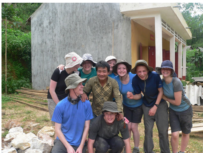
Working hard on the community project

A group of Post 16 Redland Green learning community students travelled to Vietnam during July 2011 and stayed in a local village to get involved with a community based project, where they made a real difference to people's lives. This was a fantastic opportunity for students to soak up the culture and customs of the Vietnamese people, as well as helping a remote Vietnamese community in a very practical way. There is a photo gallery on the North Bristol Post 16 Centre website if you would like to see more about their trip!